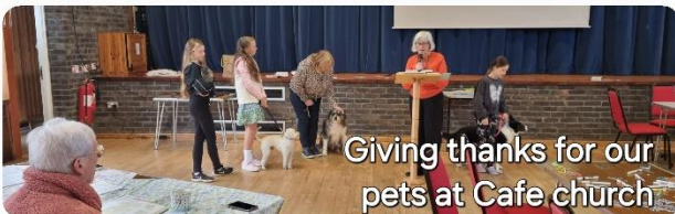
Giving thanks for our pets at Cafe church